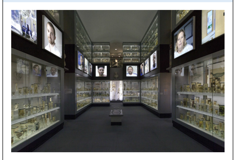
FIGURE 4 One of the Three Parts of the Exhibition "Transplant and Life"

John Wynne and Tim Wainwright. Installation in the Crystal Gallery of the Hunterian Museum, Royal College of Surgeons, London, UK. November 2016-May 2017. ©John