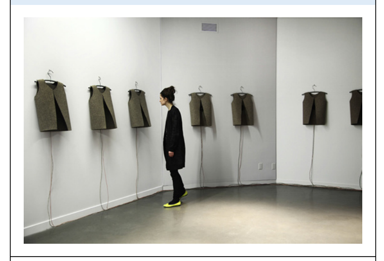
FIGURE 2 "Heart of the Matter v.1"

Alexa Wright (2014). PHI Centre, Montreal, Quebec, Canada (5,6). ©Alexa Wright.