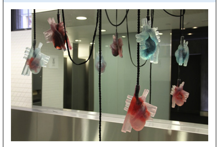
FIGURE 3 "A Tender Heart"